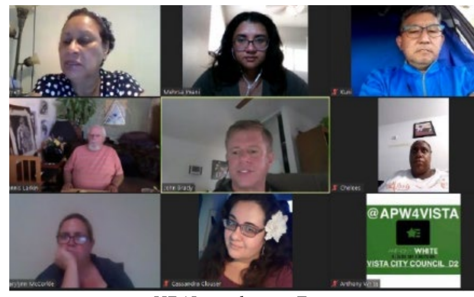
HEAL members on Zoom

HEAL is looking to expand its network in the coming months, and begin engaging new individuals with lived experience of homelessness into the program. Hopefully in the new year a new leadership and advocacy training can be offered to new HEAL members.